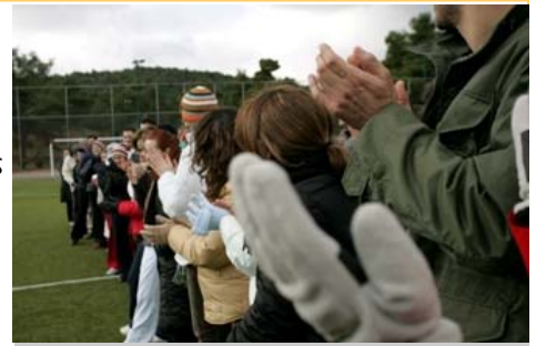
Picture from the team building workshop