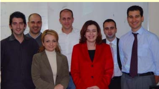
Picture from the lecture on Equity Markets at the MSc in Business for Lawyers Investment Banking course on December 1, 2005

Students of the MSc in Business for Lawyers had the opportunity to meet - and learn from the invaluable experience of - distinguished practitioners in the field of Finance.