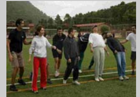
Team Building Workshop in Sofiko