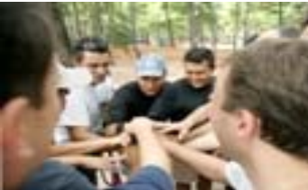
Team Building Workshop at Club Med, Gregolimano