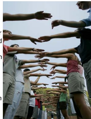
MBA Team Building in Sofiko