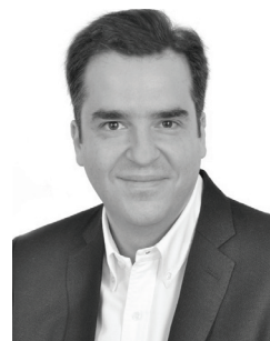
Giorgos Tsiakas MATTEL