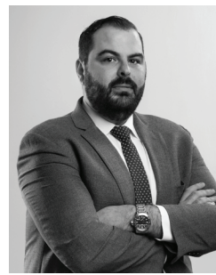
Dimitris Pizanias @anytime INSURANCE ONLINE BY INTERAMERICAN